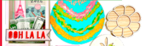
IMAGE TRANSFER ON WOOD DEMO Fri., 8/16 12 - 12:30pm | Sat., 8/17 12 - 12:30pm | Sun., 8/18 11 - 11:30am

CRAFT CLUB MEMBERS SAVE AN EXTRA 10% OFF!