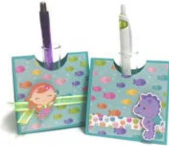
Template for Opening

3. Take the 3.25 in. x 3.25 in. printed paper square and center on one of the 3.5 in. sections. Tape down. This will be the front panel of the holder.